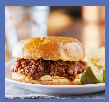
Cafeteria Sloppy Joes

Many of us remember eating sloppy joes in school. With back-to-school season in full swing, "Cafeteria Sloppy Joes" are the perfect late-summer recipe to try! Visit CHELCO.com/recipes to learn this delicious and simple recipe.