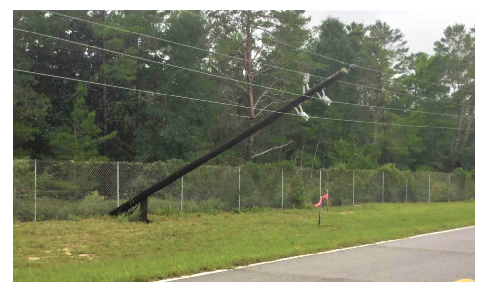
A fallen power line leans over the highway following Hurricane Sally in September 2020. Always stay away from downed lines and call 911.

Thunderstorms, hurricanes, tornadoes and flooding often leave behind more than damage. In many cases, they can leave hidden dangers that could be life-threatening.